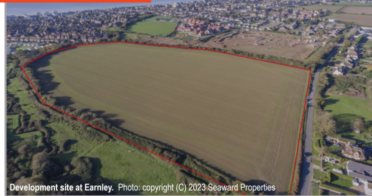
Jess is apalled to see flood-plain arable farmland along our beautiful coastline being covered in "luxury" houses

People across the Chichester area are anxious about the deluge of inappropriate property development proposals